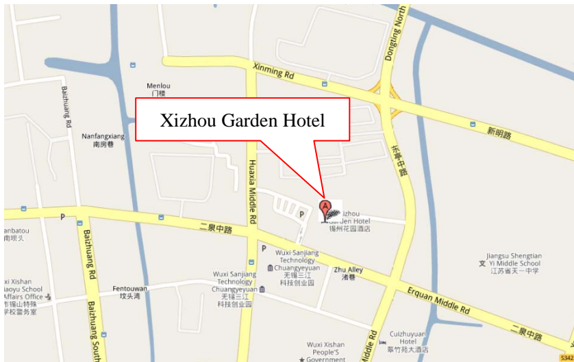
Xizhou Garden Hotel and its location